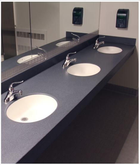
Restroom Vanity Dundalk, Maryland