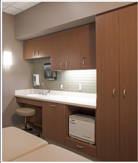
Patient Exam Room Greenwood, Indiana