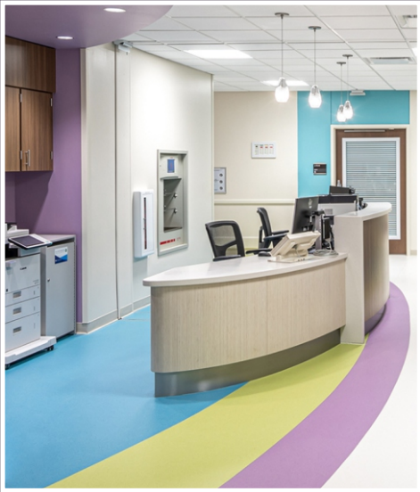
Nursery Station Highlands Ranch, Colorado