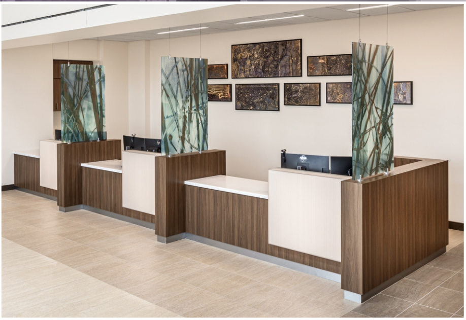
Registration Desk Highlands Ranch, Colorado

TMI sources raw materials from the best vendors in the industry, based upon a strict set of requirements including competitive pricing, quality materials, and excellent customer service. As a result we offer our customers high quality finished products which meet their individual design needs and budget requirements.