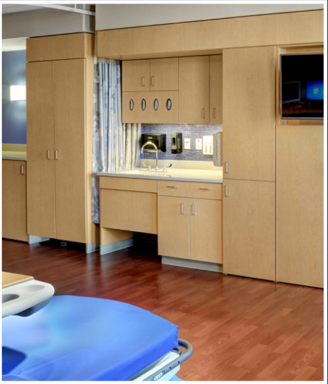
Patient Room Denver, Colorado