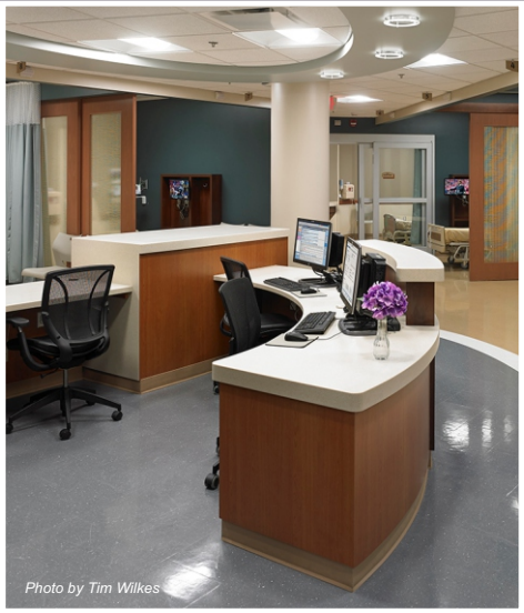
Cancer Treatment Batavia, New York