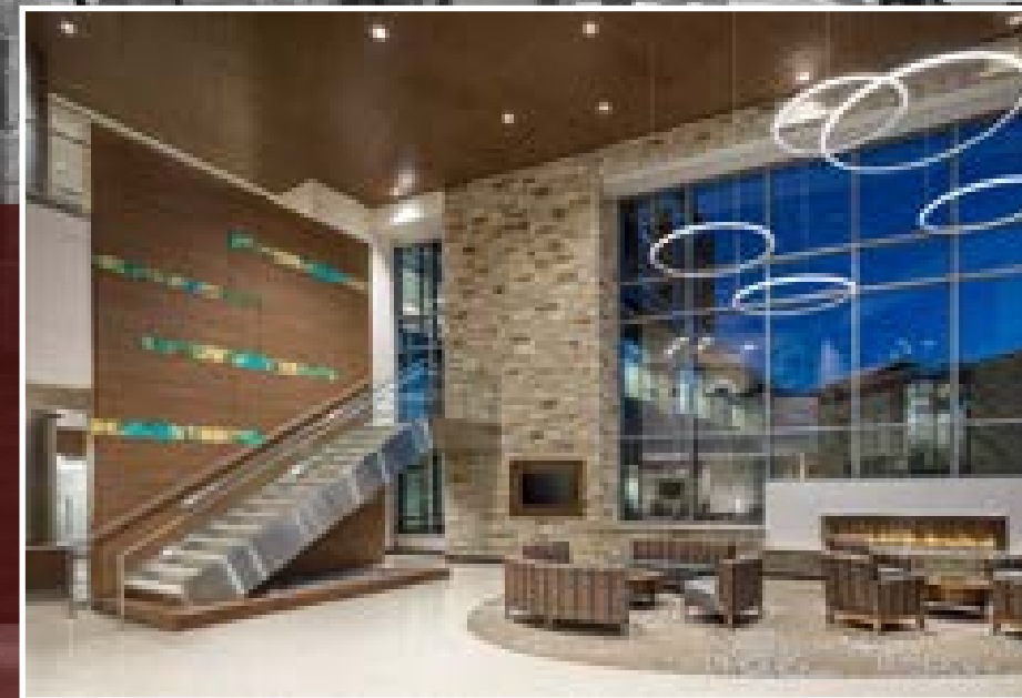
Custom Wall Panels Highlands Ranch, Colorado

TMI sources raw materials from the best vendors in the industry, based upon a strict set of requirements including competitive pricing, quality materials, and excellent customer service. As a result we offer our customers high quality finished products which meet their individual design needs and budget requirements.