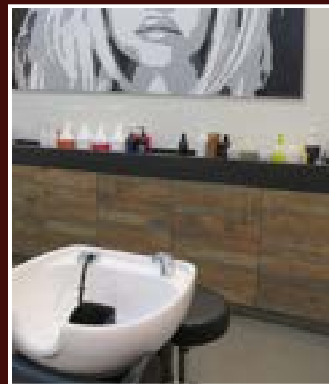
Salon Raleigh, North Carolina