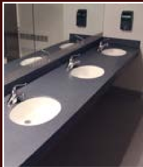
Restroom Vanity Dundalk, Maryland