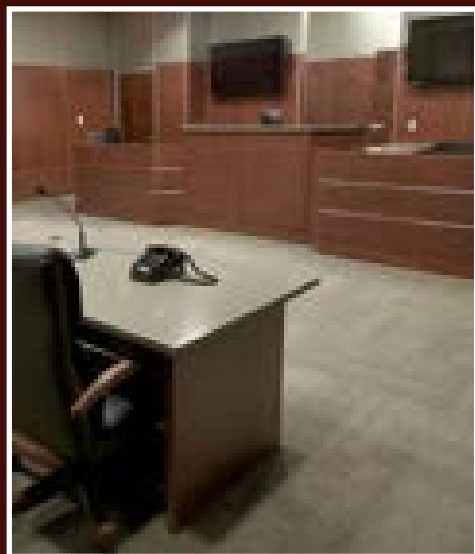
Court Room Raleigh, North Carolina