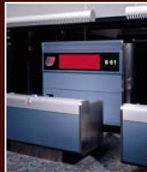
Airport Gate Counter Denver, Colorado