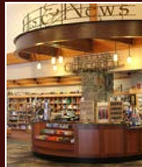
Retail Sales Belgrade, Montana