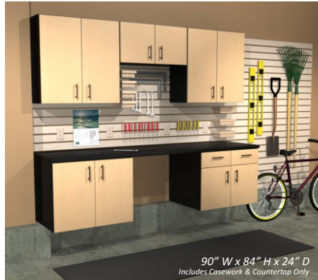
90" W x 84" H x 24" D Includes Casework & Countertop Only