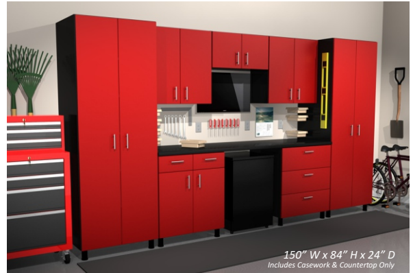
150" W x 84" H x 24" D Includes Casework & Countertop Only