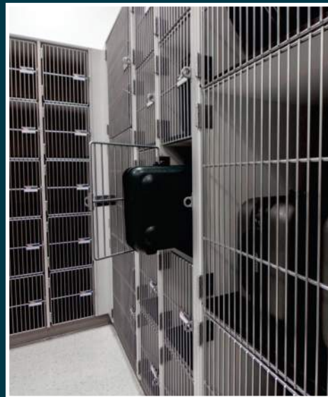
Instrument Storage Apex, North Carolina