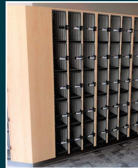
Individual Instrument Storage Holmen, Wisconsin