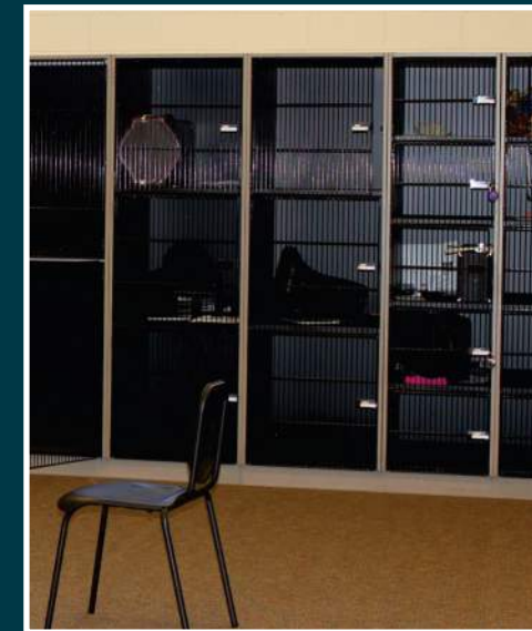
Large Instrument Storage Mandan, North Dakota