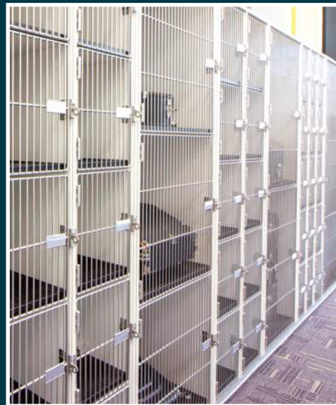
Instrument Storage Greensboro, North Carolina