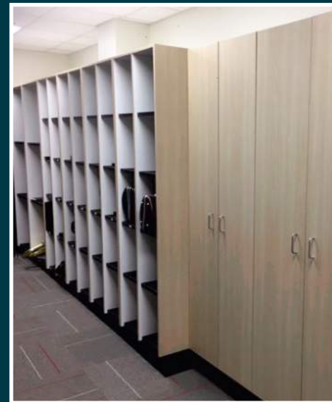
Open Instrument Storage Dickinson, North Dakota