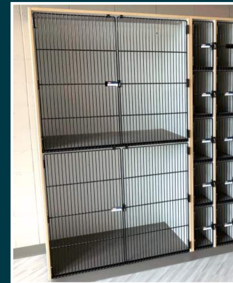
Large Instrument Storage Holmen, Wisconsin